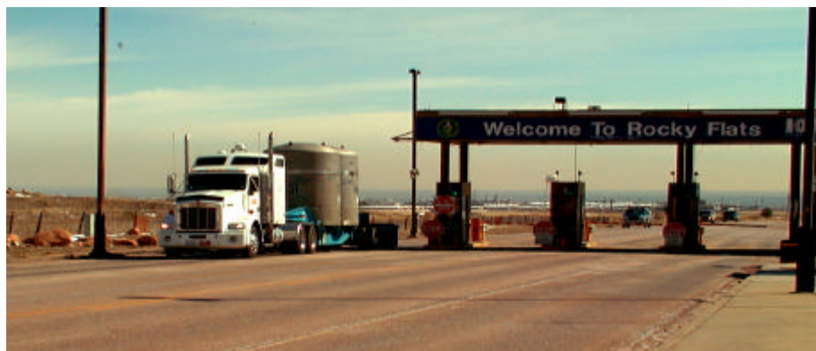
Truck Leaving Rocky Flats with Waste Shipment to WIPP

Rocky Flats is the only place in the nation that has used the hydraulic hammer method of horizontal drilling for sampling potential contamination under building foundations. Combined, these two waste minimization efforts saved taxpayers more than $300,000.