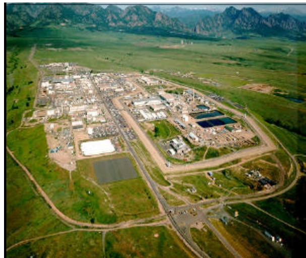
Rocky Flats, CO