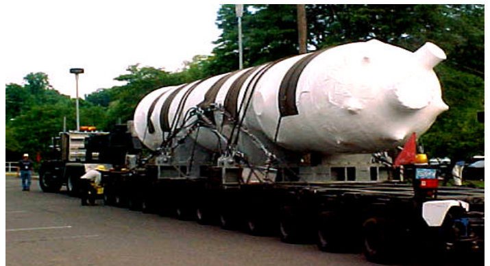
Pressurizer On Truck to the Rail Spur