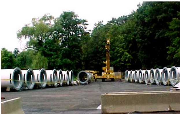
Liners to the Vertical Concrete Casks

Independent Spent Fuel Storage Facility (ISFSI) - Work on building the ISFSI is on hold. The Town of Haddam has rejected CY's building application to build the facility and has rejected CY's compensation offer. CY has filed suit, seeking resolution of the issue in court. NAC has delivered all 43 fuel storage cask liners and associated parts to the site. The liners make up the inner wall of the concrete cylinders that will cover the fuel canisters. The concrete cylinders will be manufactured on site at a later date.