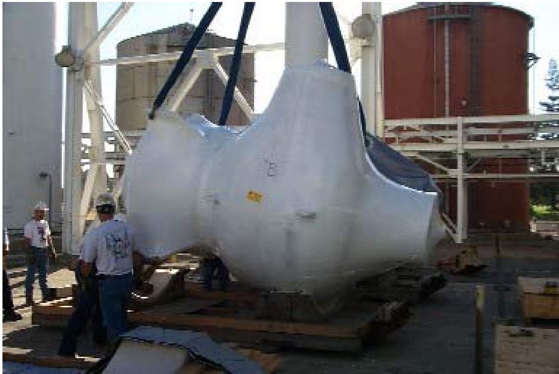
Reactor Coolant Pump Ready for Shipment