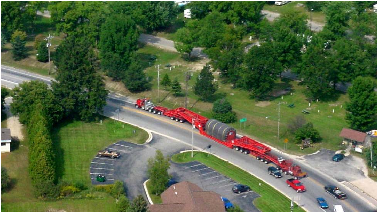
The reactor vessel shipping container en route to Big Rock Point.