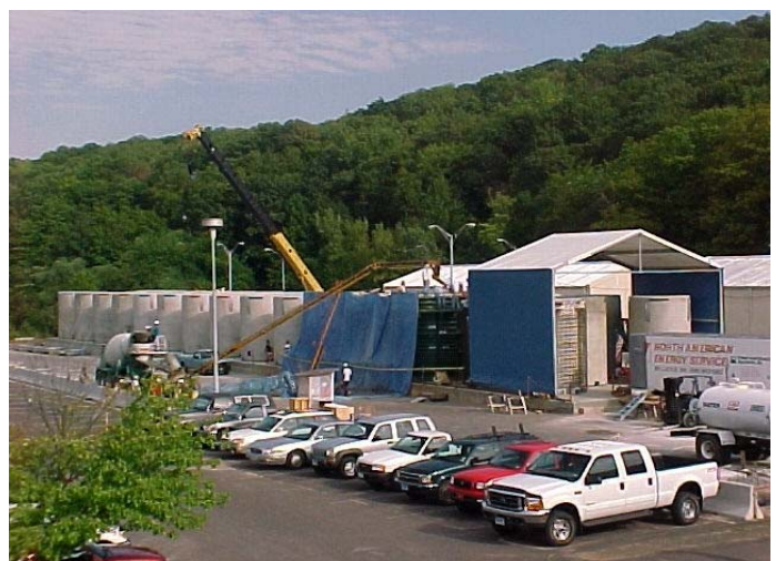
Concrete Pour of Vertical Concrete Containers