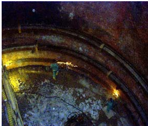
From the Top Looking Down, Installation of Third Support Ring

In conjunction with the completion of work the Saxton project staff has been meeting regularly with the Nuclear Regulatory Commission's staff to resolve the outstanding issues on Saxton's License Termination Plan. Based on the success of these meetings, an updated License Termination Plan was submitted on September 30, 2002. The current schedule projects the Final Status Survey being completed and license termination by July 31, 2003.