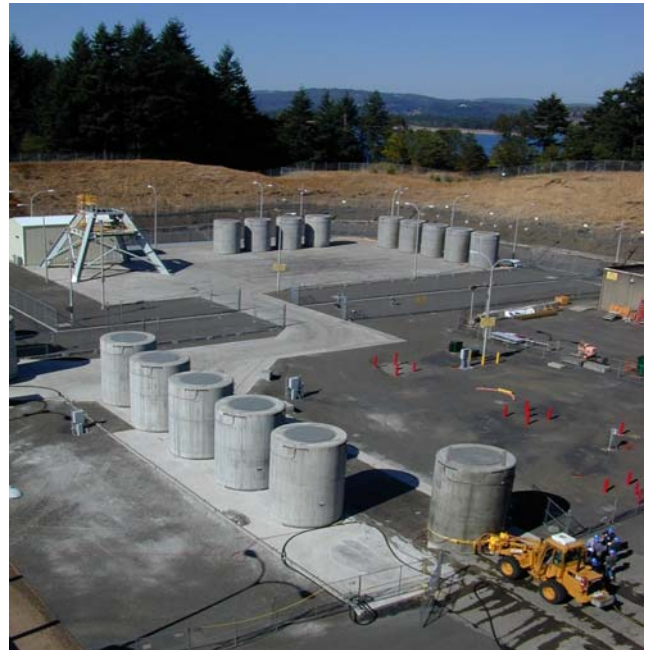
Concrete Cask Movement OJTs

Fabrication activities for the Trojan ISFSI components continue. As of September 26, 2002, 20 of the 34 multi-purpose canisters that will be loaded have been delivered to Trojan. Fuel loading is scheduled to begin in November 2002.