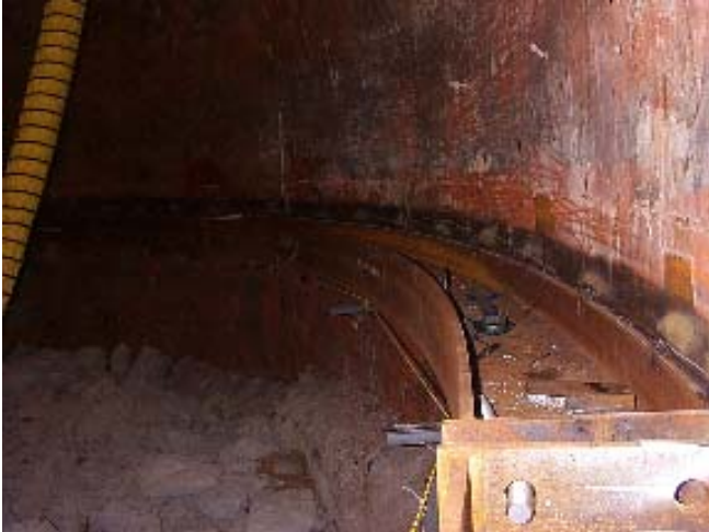
Ring Beam Installation to Provide Buckling Support

The main dismantlement activity at the Saxton Facility is removal of the concrete from inside the Saxton Containment. The Saxton Containment is somewhat unique in that it is an approximately 100 foot long steel vessel, half of which is underground. The shell has an 18 inch thick concrete liner to support it from collapse due to soil and groundwater pressure. Due to the discovery of contamination on the shell, even in areas where the surface concrete was not contaminated, a decision was made to remove all the concrete from the containment. Concrete removal from the Saxton Containment started in February 2002 and is nearing completion with a projected end date in mid-October. This will complete the last major work activity at the Saxton site. The following pictures provide some perspective on the project.