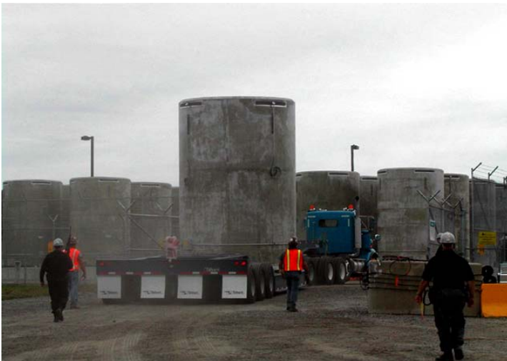
First loaded Vertical Concrete Cask to ISFSI