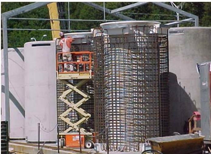
Last 2 of 43 Vertical Concrete Containers Under Construction

Land Donation - The Conservation Law Foundation (CLF), a New England based environmental advocacy organization, continues to develop a process for potentially donating a major portion of CY's property for open space conservation. CLF has met with over 100 stakeholders and is currently in the process of establishing an advisory committee to guide the land donation process. Through a collaborative process, the multi-stakeholder membership of the advisory committee will review the data gathered and assess the list of potential land donation parties/organizations and land use options. The advisory committee will issue proposal requests and review the proposals, making its recommendation to CY by December 2003.