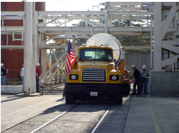
The Last Spent Fuel Canister on the way to the ISFSI

Site Re-Powering – SMUD is waiting for state approval for a 500 MW natural gas fired plant on utility property south of the current security fence. The plant will make use of the switchyard, water supply and discharge structures.