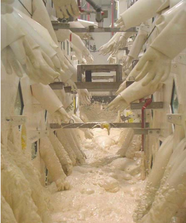
Glovebox Interior Foamed for Disposal Without Removal of Leaded Glass & Shielding

The pace of demolition of buildings at Rocky Flats continues to accelerate. Since March, three major buildings and three trailer complexes in the site's industrial area have been demolished. In addition, remediation of the notorious 903 Pad, where leaky drums of plutonium contaminated oil were stored during the 1960's, is well under way.