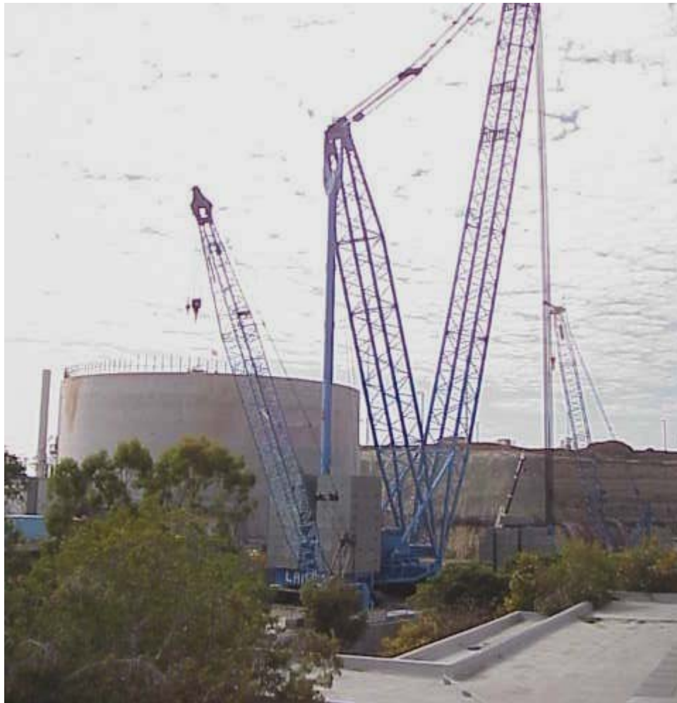
Heavy Lift Crane at SONGS Unit 1

The component lifts will be completed in October of 2002. The SG's, pressurizer and RPV Head will be at the Envirocare of Utah disposal site before the end of the year. The Reactor Vessel is scheduled to move to Barnwell, South Carolina early in 2003.