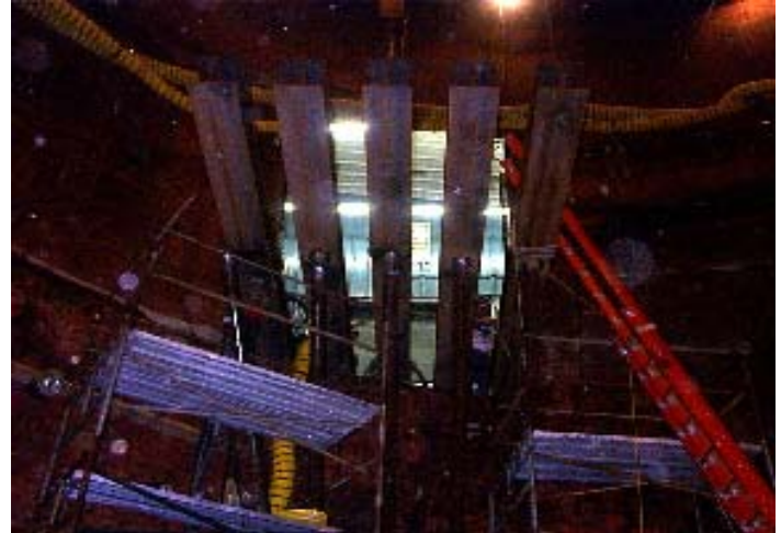
Installation of Work Platform, Bottom Looking Up