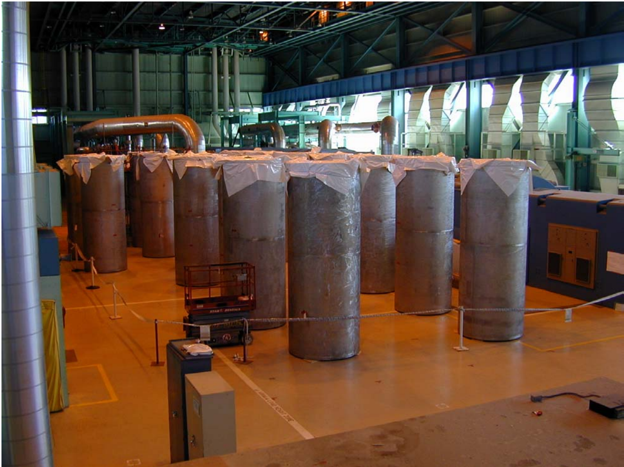
MPC Laydown Area

The remaining major tasks associated with the ISFSI Project include licensing, fabrication of the remaining spent fuel canisters, training of fuel load personnel, and loading of the canisters. Engineering support for field changes and enhancements from lessons learned are being provided as required.