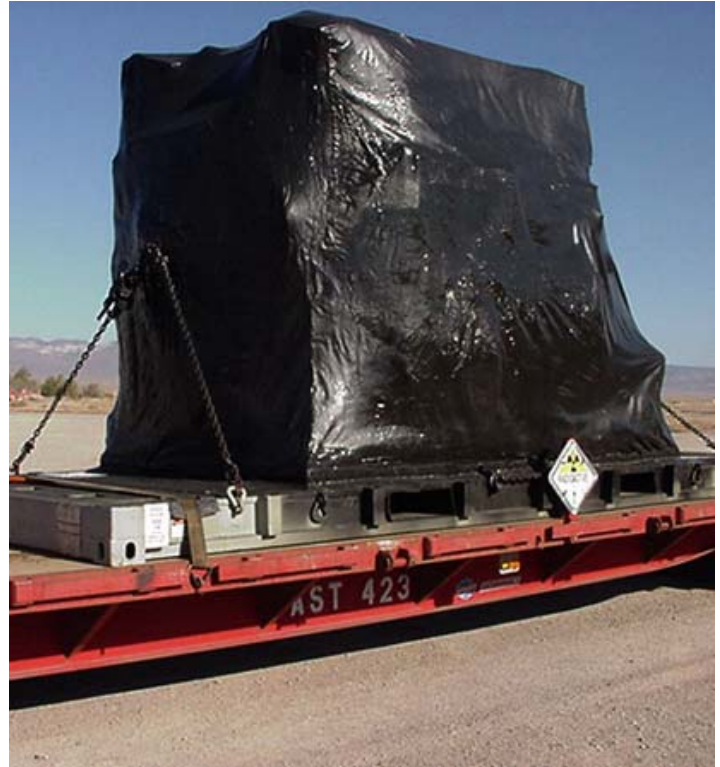
Furnace Coated with Spray-On Polyurea Coating for Shipment