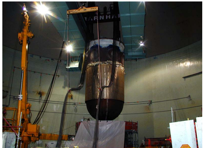
Reactor Pressure Vessel Lift from Cavity